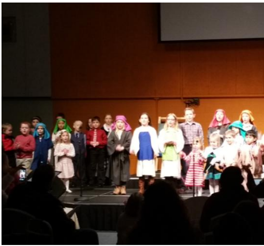
HBJ 2016, "Christmas Is..."